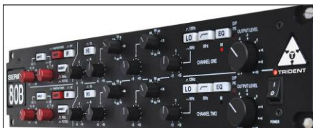
The Series 80B module